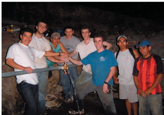
Photos of the EWB projects and the people they assist are on view at http://ewb.rice.edu