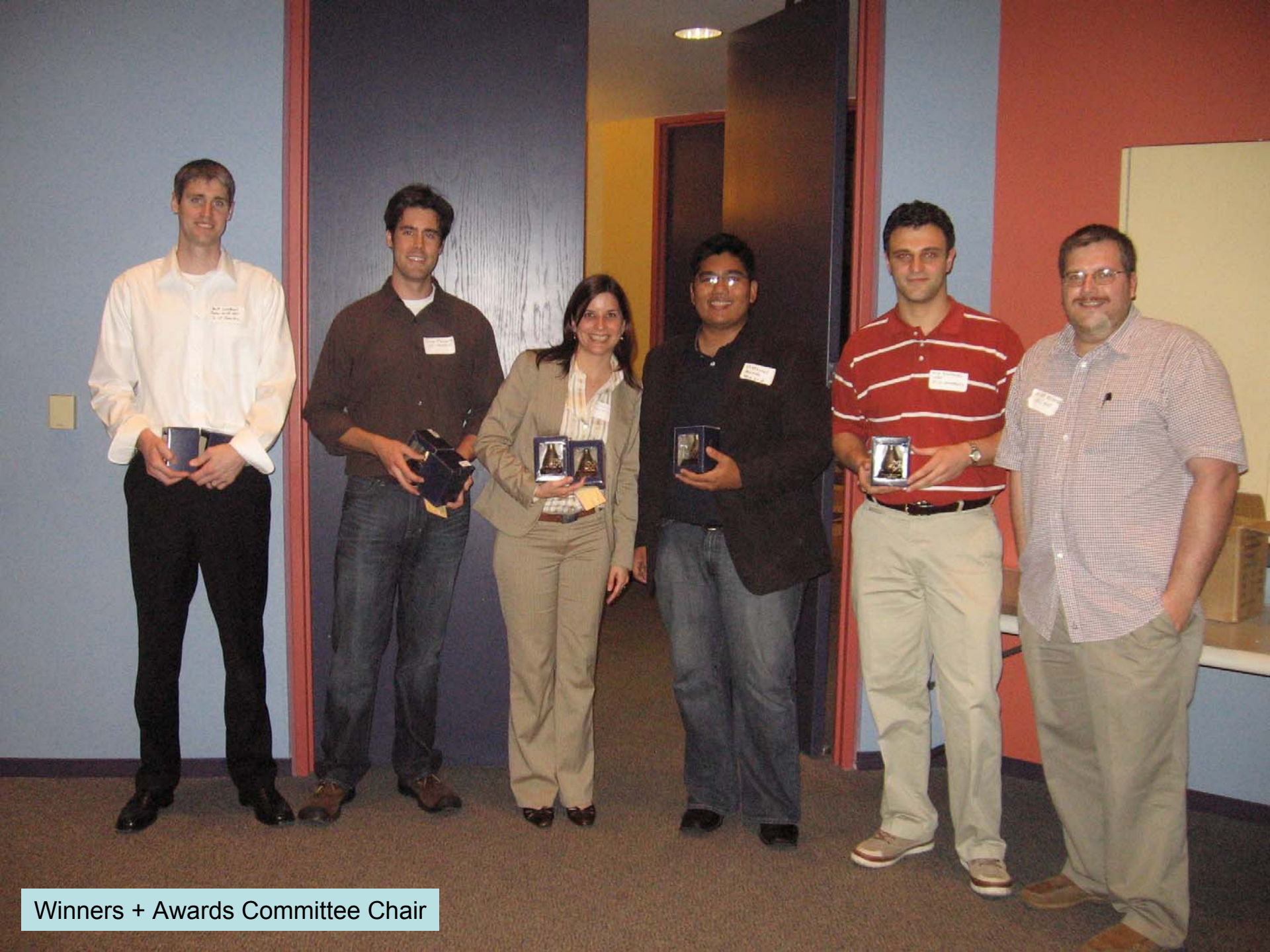
Winners + Awards Committee Chair