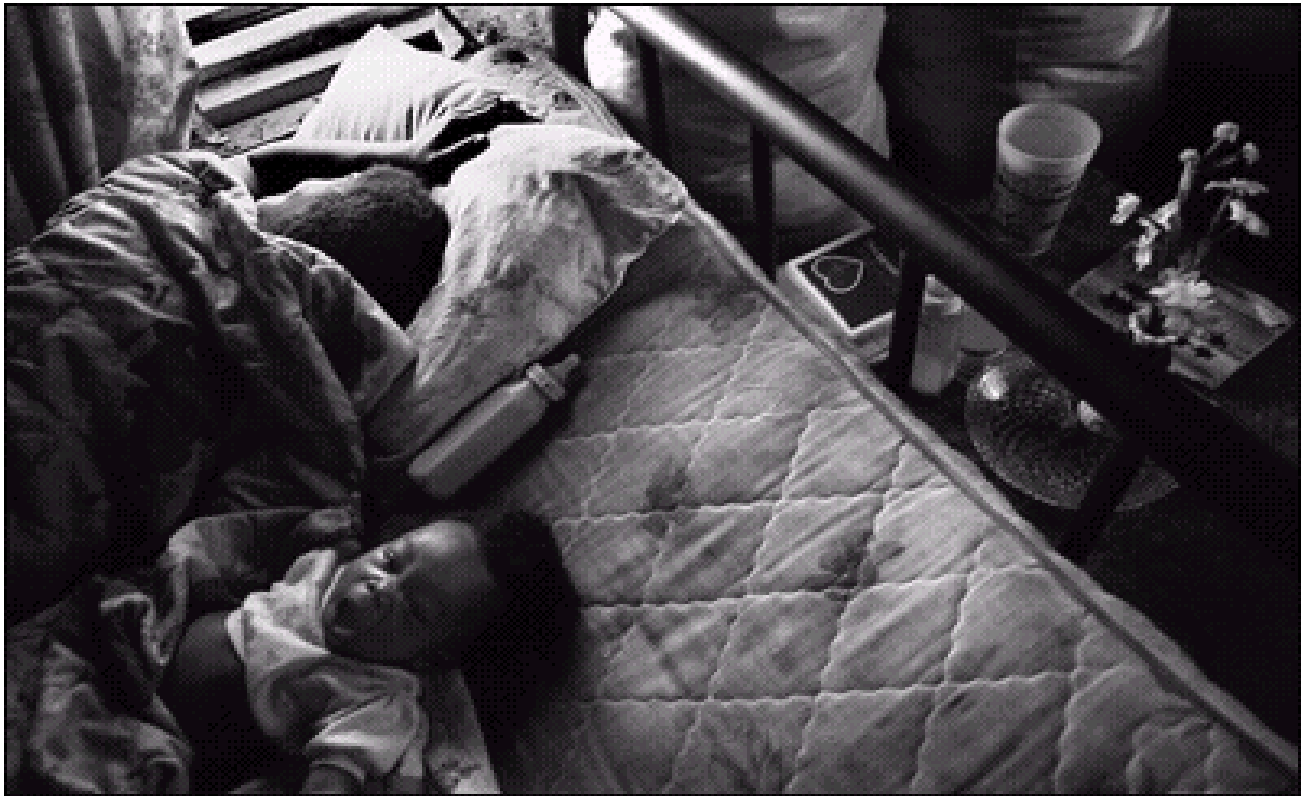
Sleeping in the projects: crowded, dirty, and hot.

picture of another small child bending into the bucket, with its head submerged under water. A huge X is painted over this picture. My mother dilutes the boiling water with cold faucet water until the temperature is right.