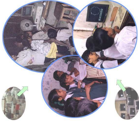
From garages in your home to educating poor children ... The pictures here show FOYM computers from our first shipment being put to good use in the slums of Kapurbawdi and Phule Nagar, near Mumbai, India.

In addition to computer donations, we also welcome any assistance in storing the computers in the US, transporting them overseas, and clearing the shipments through the border.